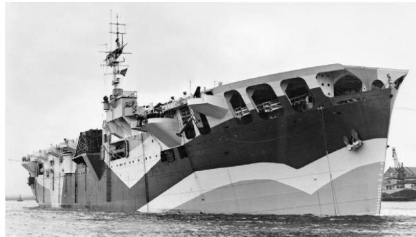
HMS Pretoria Castle

Served on HMS Pretoria Castle 26/10/43 to 4/11/43, HMS Pretoria Castle was a Union-Castle ocean liner converted into a Royal Navy armed merchant cruiser, and then converted again into an escort carrier. After the war she was converted back into a passenger liner and renamed Warwick Castle.