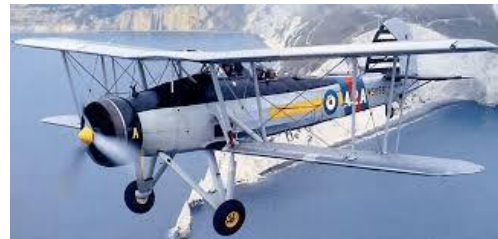
Fairy Swordfish Torpedo Bomber