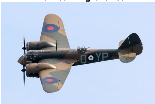
Bristol Blenheim – Light Bomber