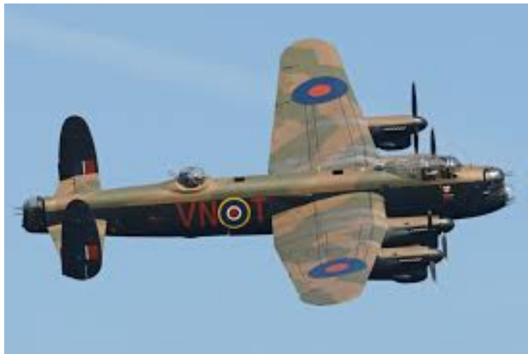
Avro Lancaster Heavy Bomber

In April 1944 he is back with 35 Squadron at R.A.F. Graveley who are now equipped with Avro Lancaster heavy bombers, and are part of the Pathfinder Force, and again he serves as Wireless Operator, his first Op is on the 26th to Essen. In May he has Ops to Boulogne (19th), Duisburg (21st), Dortmund (22nd) and Aachen (24th).