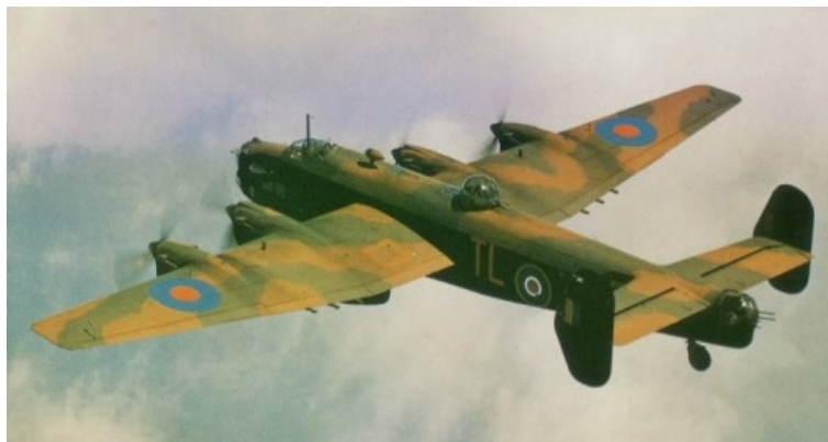
Hadley Page Halifax Heavy Bomber

He then transfers sideways to 35 Squadron, still at Linton-on-Ouse, and still as Air Gunner, this time on Halifax heavy bombers.