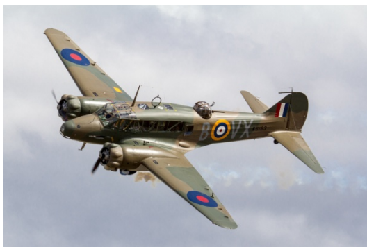
Avro Anson – Light Bomber

In 1940 he transferred to 17 OTU (Operational Training Unit) at Upwood and flies in Avro Anson and Bristol Blenheim light bombers.